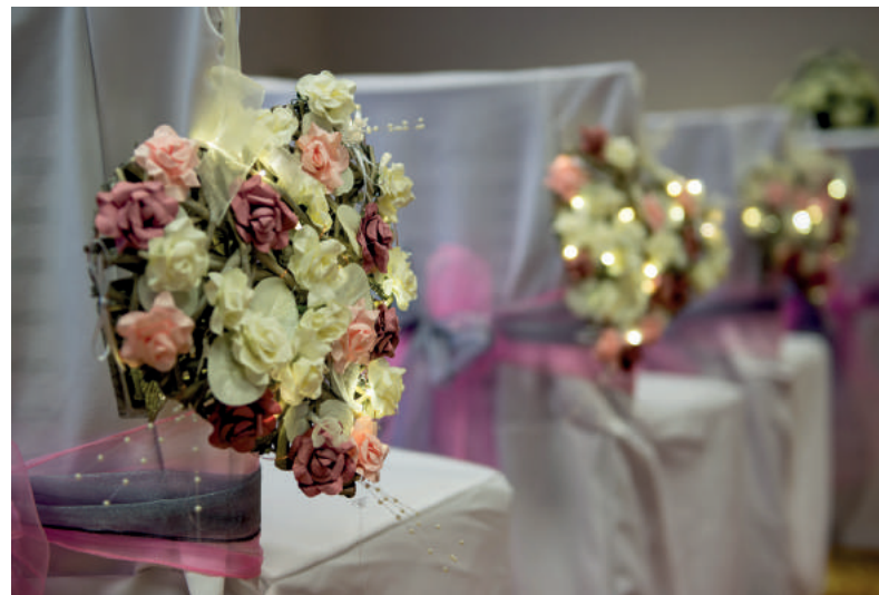
Top; photography courtesy of David Webb North East Wedding Photographer